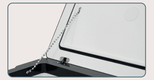
Pull chain fixture